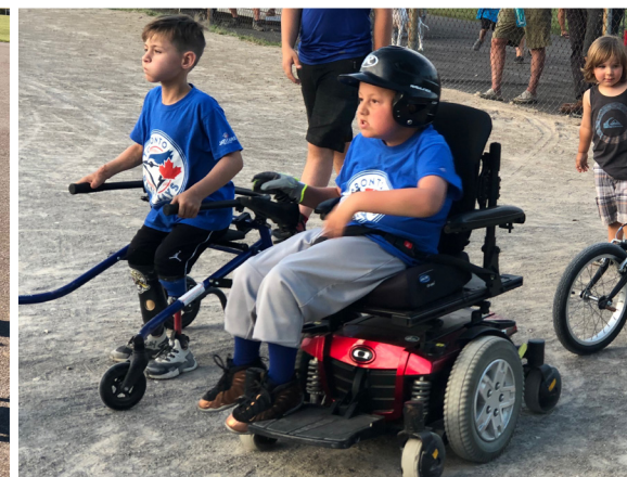
Hamilton Challenger Baseball Association