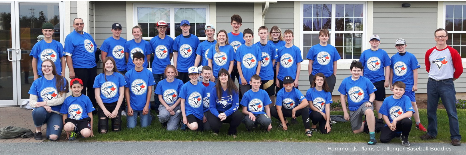
Hammonds Plains Challenger Baseball Buddies

Cloverdale Challenger Baseball has been running for 3 years and had a roster of 50 amazing Challenger Baseball athletes in 2018. The program has evolved immensely over the years. In their first year, Cloverdale ran a typical baseball game with their athletes each week, however, they found that many of their athletes in the outfield were disengaged while waiting for their turn up to bat. Now, after consideration, feedback and attending annual trainings, Cloverdale incorporates many different strategies, activities, and skills and drills to help ensure their athletes are constantly participating for the entire session. The coaches made it a priority to actively work on finding new ways to engage the athletes in order to support the athletes' development in relationship building and communication skills. This year they found success by splitting the field into 3 stations; an infield baseball game, outfield skills and drills activities (i.e. colourful parachute games) and a batting station to give every player a chance to hit several times! In the coming season, the team is planning on inviting a number of mature athletes with cognitive disabilities to guest coach in the younger divisions as a way to build connections among the leagues.