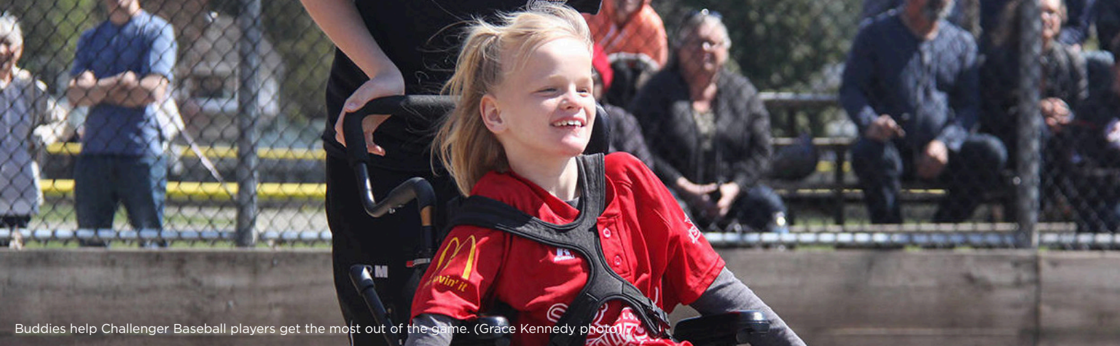
Buddies help Challenger Baseball players get the most out of the game.